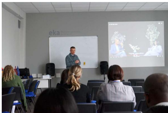
Workshop "GREENENTRE4DEAF" during IAW, April 2025

GREENENTRE4DEAF Project is funded by the European Union Erasmus+ programme KA220-HED Cooperation partnerships in higher education, Project grant agreement No. 2024-1-ES01-KA220-HED-000245483.