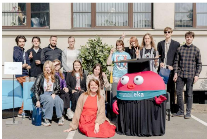
Participants of the students' conference, 31.05.2025.