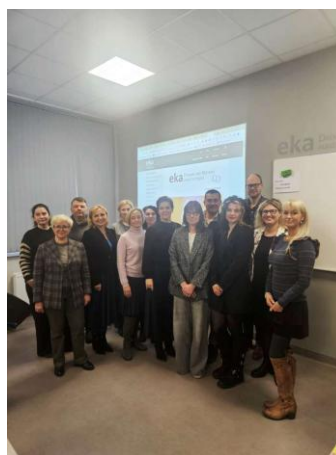
AI training session, March 3-5, 2025