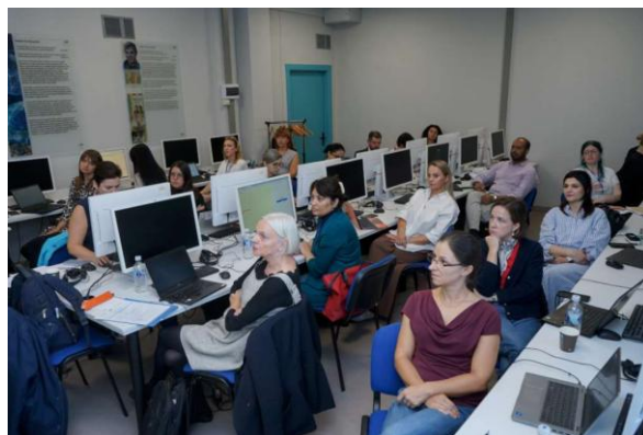
Training during the course “Designing and Writing Successful European Projects with Artificial Intelligence”, September 23-27, 2024

In winter, on December 12, 2024 a webinar titled “Supporting the Green and Digital Transitions in Education and Training: Greening the Future” was organized by EKA University of Applied Sciences in collaboration with the European Digital Learning Network ETS as part of the DigitEdu 2024 project. The event gathered 7 expert speakers and 52 listeners from across 14 countries to explore sustainable and digital innovations in education. The record of the webinar is available on YouTube for further use.