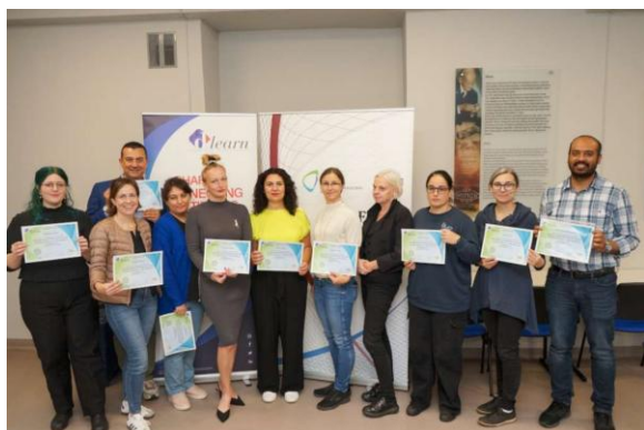
STW2024 Final day