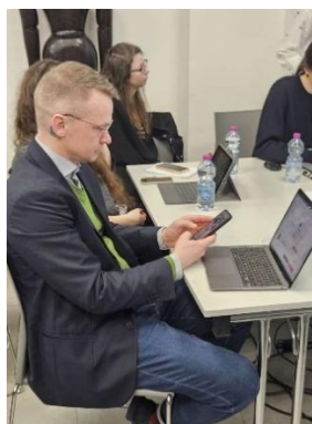
DLearn Members gather in Milan for Project Lab 2025, January 21-22