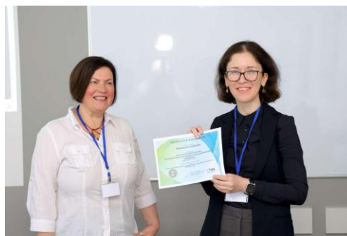
Culture studies section best paper award ceremony