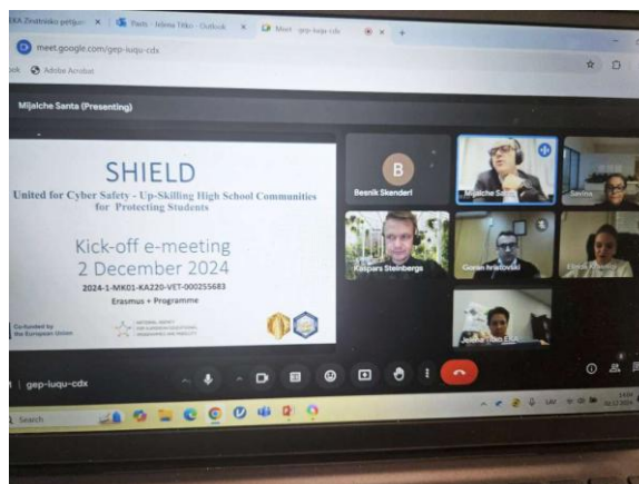
Kick off meeting of SHIELD project, December 2025

Project is funded by the European Union Erasmus+ programme KA220-VET Cooperation Partnership in Vocational Education and Training, project number is 2024-1-MK01-KA220-VET-000255683, and its duration is 01.11.2024.-31.10.2027. (36 months).